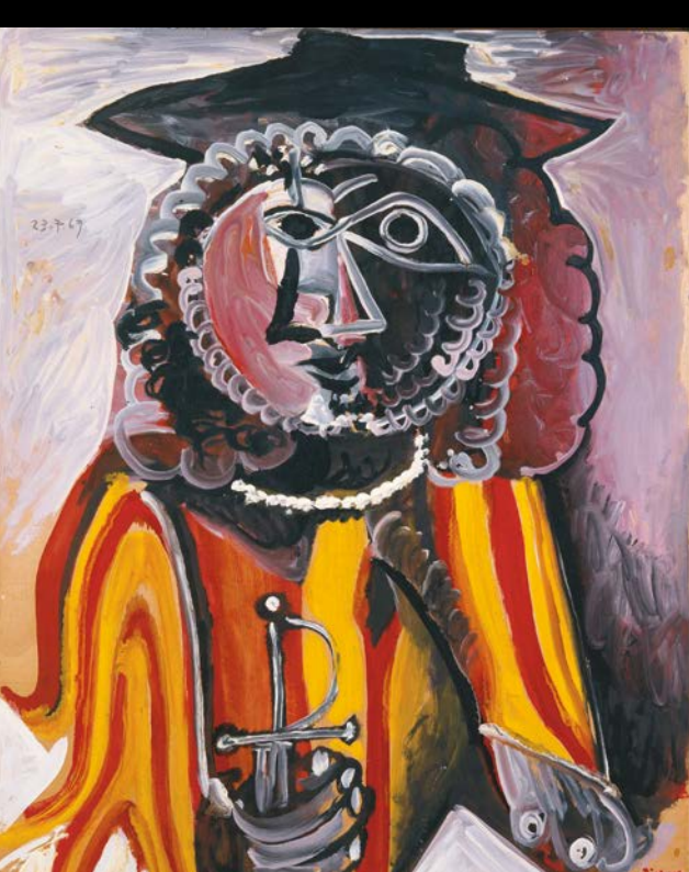
Pablo Picasso (1881–1973) Homme à l'épée (Man with Sword), 1969

Oil on wood Würth Collection (Inv. no. 10200)