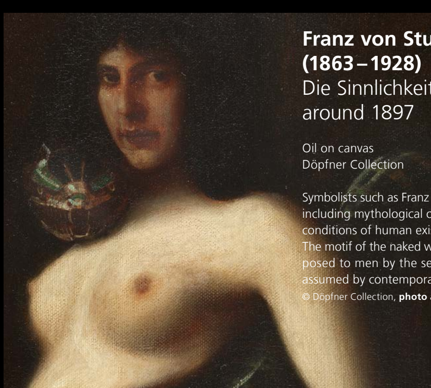
Franz von Stuck (1863–1928) Die Sinnlichkeit (Sensuality; detail), around 1897